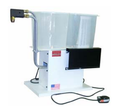
Electric Drive w/ Foot Switch & Mixer Manifold

The GOO GRINDER is a practical production tool that utilizes gear pumps to meter non-abrasive two part resins ranging from 250 to 50,000 centipoise (cps). This low maintenance system eliminates sticky, messy, and wasteful hand proportioning. The GOO GRINDER is a highly dependable, industrial quality system that provides accurate measurement of hardener and resins with a minimum of oversight.